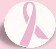
Server Awareness Pin